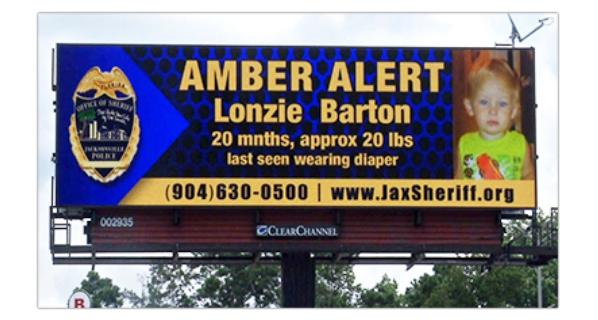
35 percent noticed AMBER Alerts or missing children alerts

the Outdoor Advertising Association of America said in an announcement.