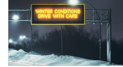
and 18 percent noticed weather alerts.