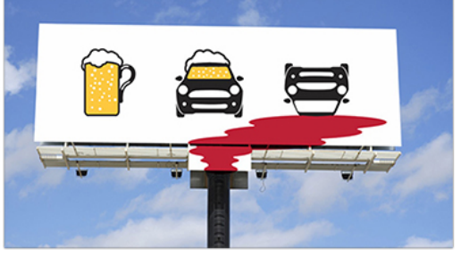
24 percent recalled community information